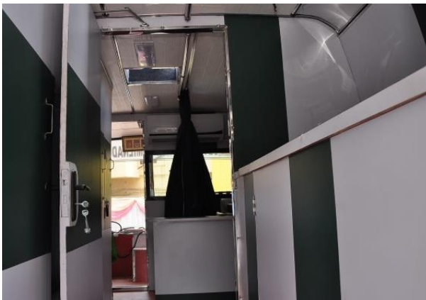
MMU Pharmacist's counter

The temperature controlled MMU will provide physician consultancy and medicines, with facilities for checking of blood pressure, blood sugar levels, and ECG. All these facilities will be provided at no cost to the patients.