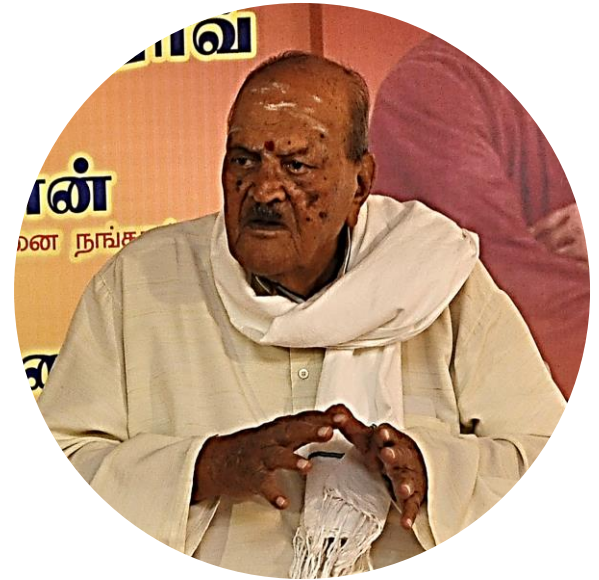
Suru-ji addressing the gathering