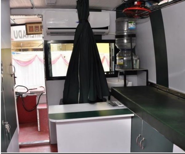
Doctor's table and patient examination desk inside the MMU

An area coordinator identified at each of the 12 locations together with a four-member volunteer team will be responsible for the logistics and communication with the beneficiaries at their respective locations.